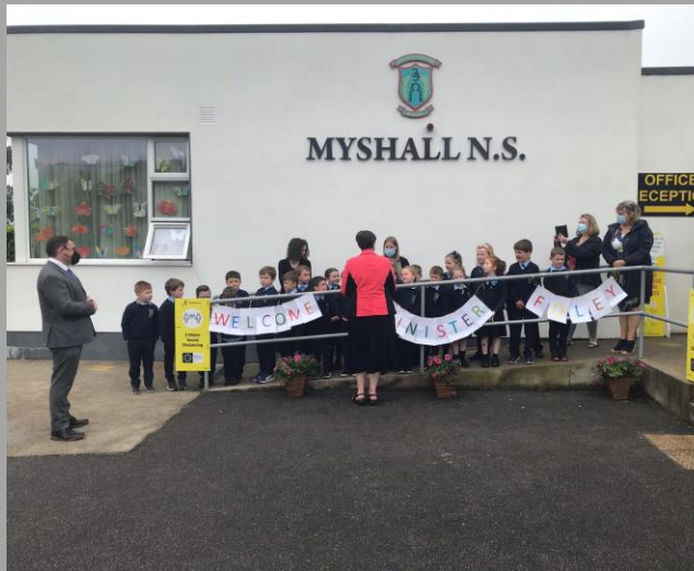
A Visit from Minister Foley!

We were delighted to welcome the Minister of Education and Skills, Norma Foley to our school on Wednesday June 23rd. The Minister greeted all of the pupils outside the school and chatted with many of them and was asked loads of great questions.